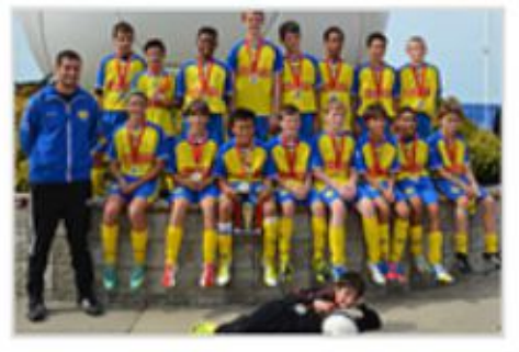
U9 Girls Yellow